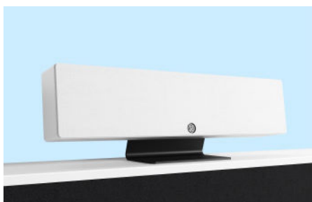
In a multi-room system with SA Silverbar