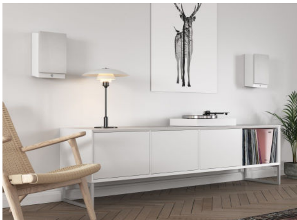
Hang it on the wall ...