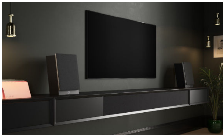
Put it on a shelf ...