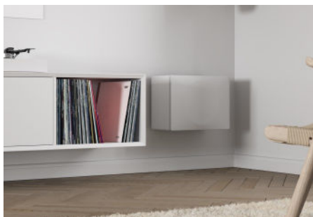
Use with Silverback Sub Solo