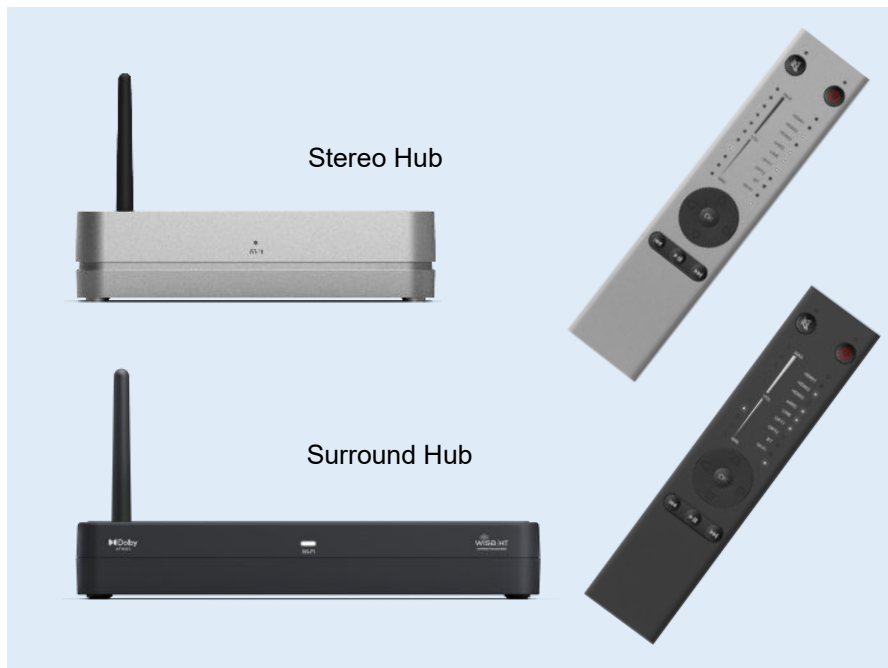
In a wireless music system or Home Theatre