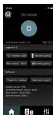
How to connect speakers and remote control with SA Cockpit

Press the pairing /connect button on the hub for max 2 seconds. The wireless LED on the speaker will stop flashing when the connection is established and the WiSA LED will light steadily.