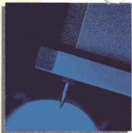
Decoupling with spikes