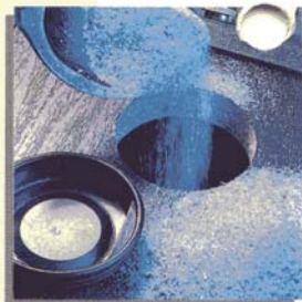
Filling the sand chamber