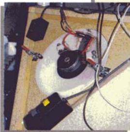
Testing drive units

An incredible care is put into every detail which involves the sound. All of it to obtain the finest quality of sound.