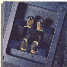
18k gold-plated terminals