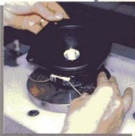
Handmade drive units

The drive units are, by the way, a fine handmade mechanism with a remarkable reliability. The membranes are treated with a special coating which is absorbed in the fibres in the membrane to avoid colouring of the sound.